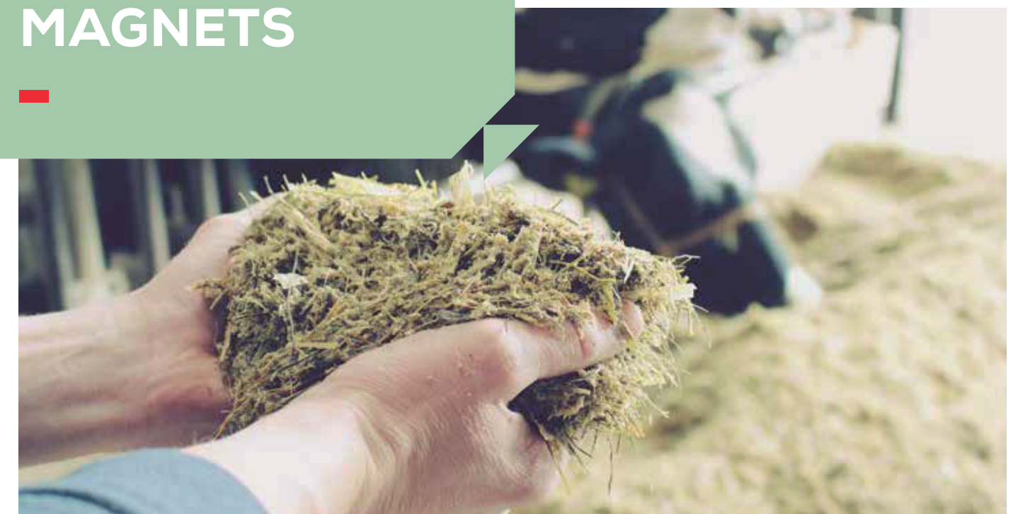
The magnets can be retrofitted on existing machines.